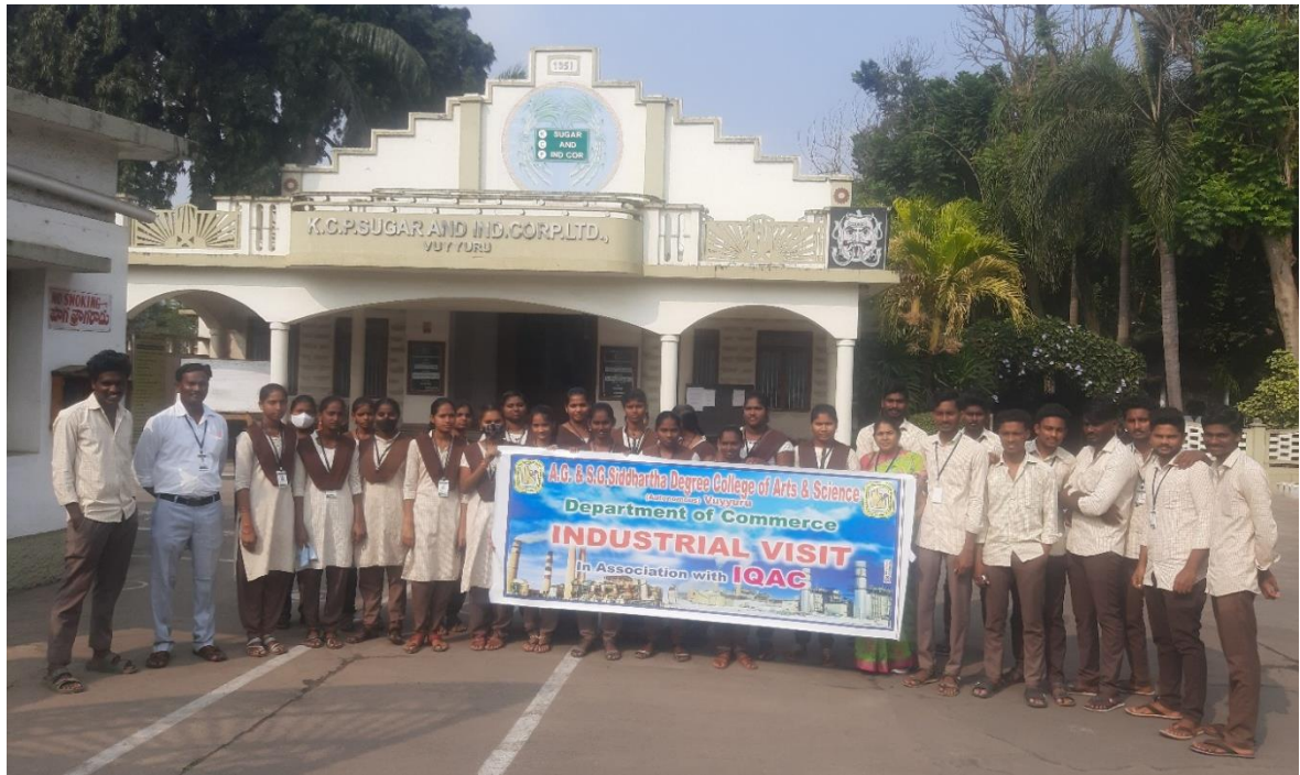
Place of visit : K.C.P. Sugar and India corporation Ltd., Vuyyuru