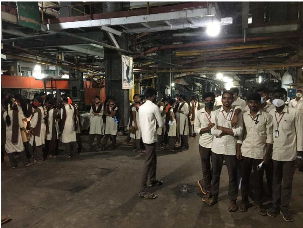
III B.com (Gen & Comp.) Students.