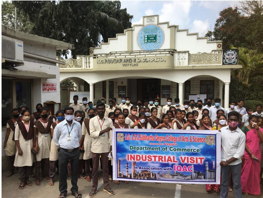
• Place of visit : K.C.P. Sugar and India corporation Ltd., Vuyyuru