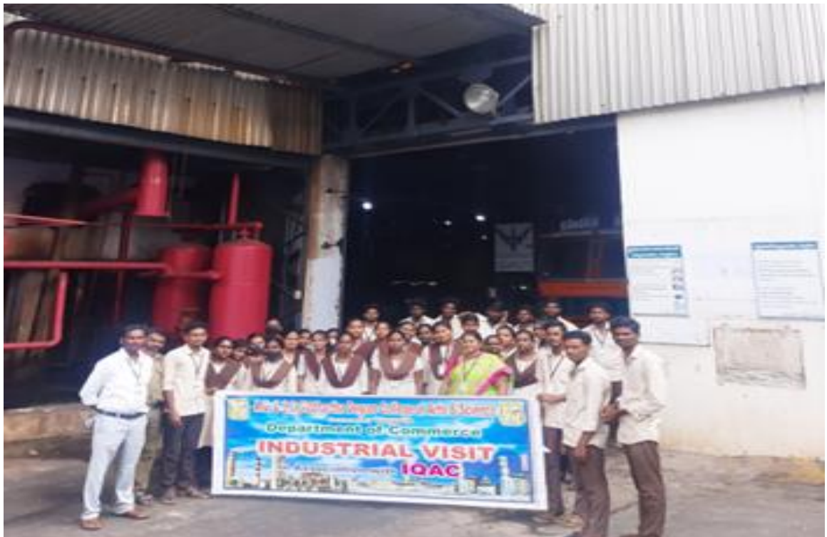
III B.com (Gen & Comp.) Students.